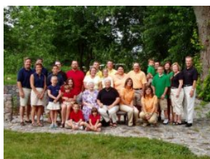
An American Extended Family

A family is a group of people that have a common ancestor. They usually live together in the same house. Although it is a fact that not all families are the same, they can be categorized into different types.